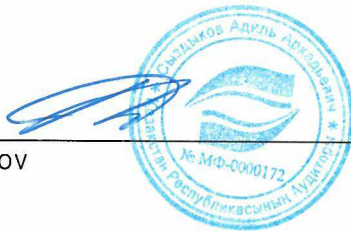
Adil Syzdykov Auditor

Auditor Qualification Certificate No. МФ - 0000172 dated 23 December 2013