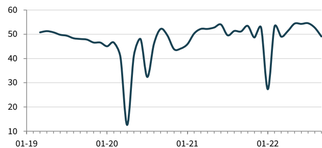
Tengri Partners Kazakhstan Services PMI Business Activity Index sa, >50 = growth since previous month

With new business continuing to rise, service providers were encouraged to take on additional staff again at the end of the