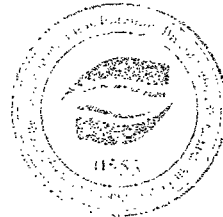
Auditor Qualification Certificate No. 0000553 dated 24 December 2003